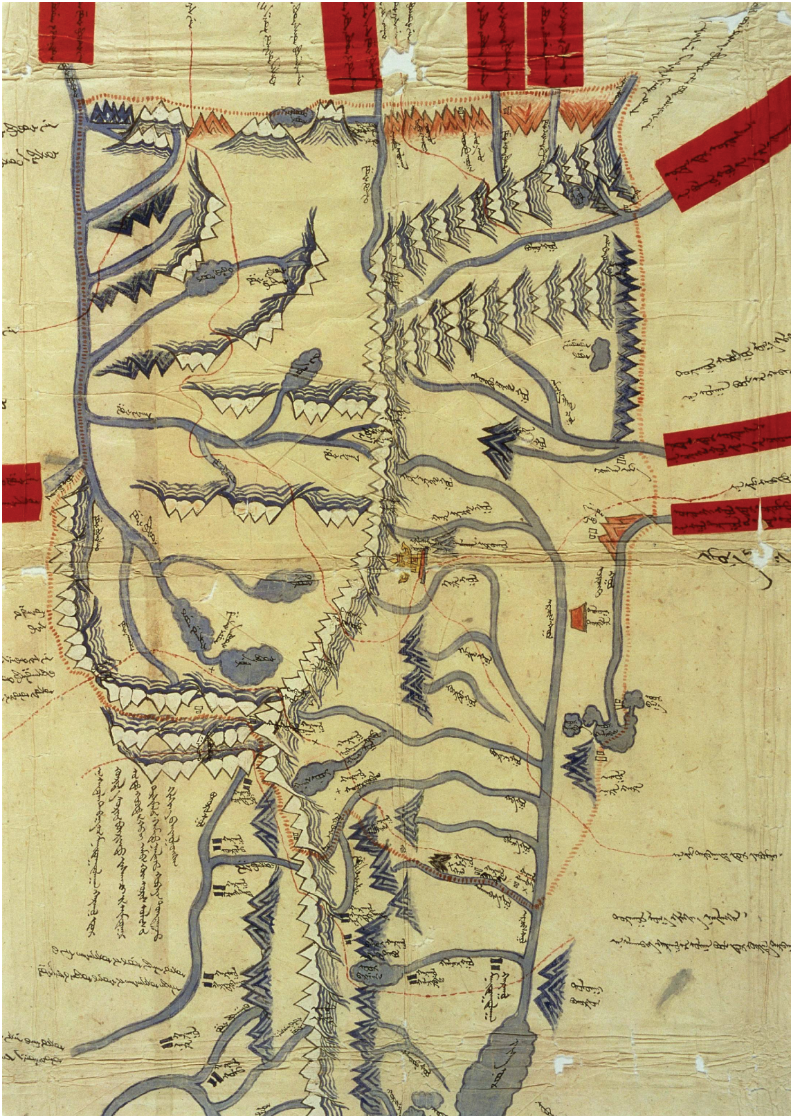
Part of a map of the seven banners of Altai Urianhai, M016 (M016-05)